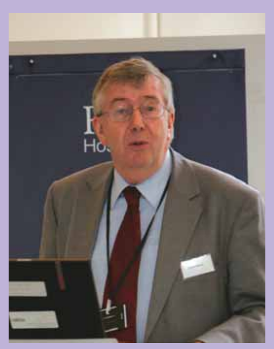
Lord McKenzie of Luton, Department for Work and Pensions Minister, addresses attendees