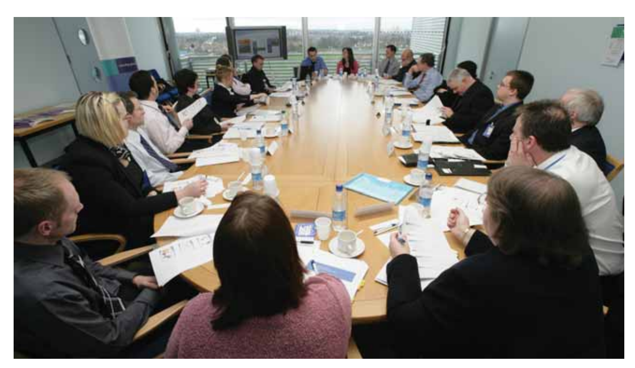
The Child Support Agency's Employers' Forum

how they might affect them. The group also discussed the proposal to test withholding from wages as the first means of collecting maintenance, as part of our commitment to work closely with employers during the policy's development.